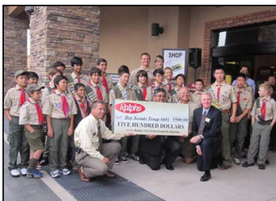
Troop 691 helped Ralph's #161, a long-time generous supporter of Scouting, celebrate their Grand Re-Opening this summer.