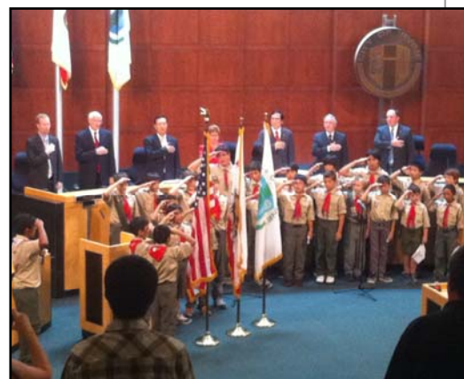
At the City of Irvine's August 23rd Council Meeting.