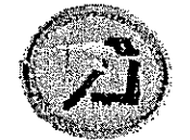
Woodwork 1ab, 5, 6a