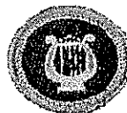
Music 3,4, instrument