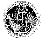
Citizenship/World 7 + worksheet