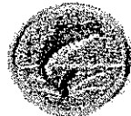
Fishing 7, 9 + test