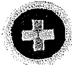
First Aid 1,2b,7