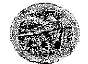
Wilderness Survival 5,6,8,9