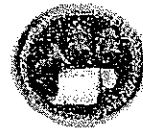
Pulp & Paper 2,3,6,7,8